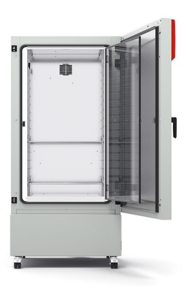
Model KB ECO 400