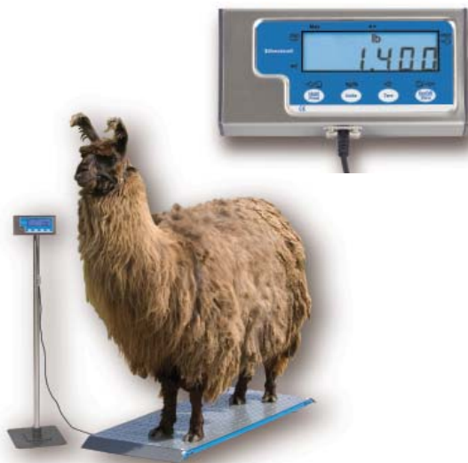
PS1000 shown with optional indicator stand