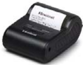
Shown with optional printer