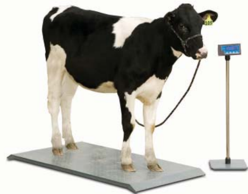
PS2000 shown with optional indicator stand