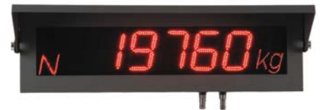
Shown with optional remote display