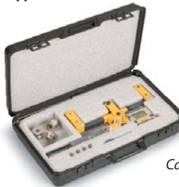
Carrying case included

Dillon also manufactures highly accurate tensiometers, mechanical dynamometers and crane scales.