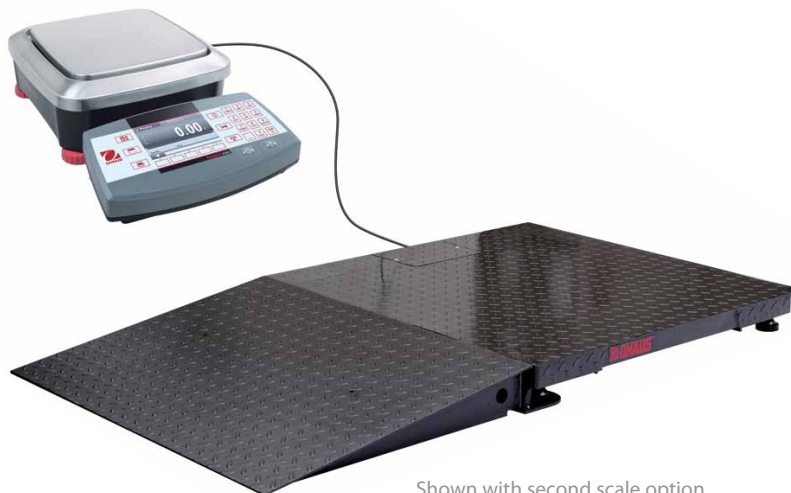
Shown with second scale option

With the remote base option, you can connect a floor scale platform or bench scale base with higher capacity in order to achieve precise results for a job of any size. Results from both scales can be displayed at the same time. Ranger 7000 can control many peripheral devices through the optional Discrete I/O interface (provides 2 input ports and 4 output ports), which can be used for accurate weight measurement in filling and checkweighing applications.