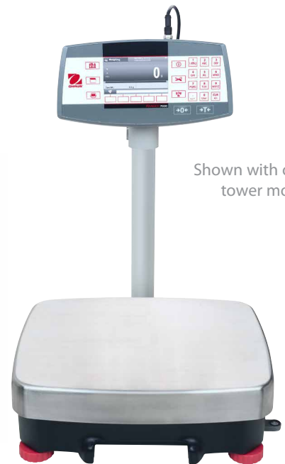
Shown with optional tower mount