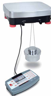
Weight below hook in use

Additionally, a weigh below hook offers the functionality to perform specific gravity tests or weigh items that cannot be easily placed on the weighing platform.